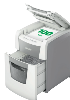
Leitz IQ AutoFeed 100 P4/P5