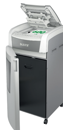
Leitz IQ AutoFeed 600 P4/P5