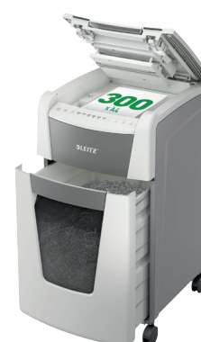
Leitz IQ AutoFeed 300 P4/P5 Leitz IQ AutoFeed 150 P4/P5