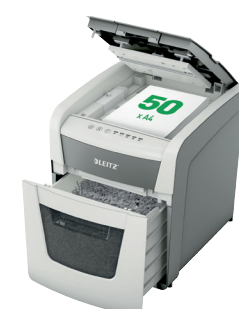
Leitz IQ AutoFeed 50 P4